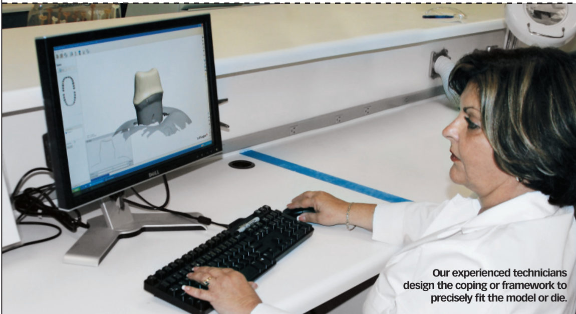
Our experienced technicians design the coping or framework to precisely fit the model or die.