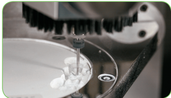
Precision scanning and milling are key to a well-fitting framework.

DLC makes it easy for labs to receive their zirconia copings in just four business days! Since a scanner is not required, laboratories merely send us an impression or a model, and DLC does the rest! Delivering a precision-milled coping guaranteed to fit is an easy process DLC is pleased to do for its laboratory customers. First, we pour the model or scan the model or the die, then design the case, and then, precision-mill the framework to guarantee the fit. The coping is delivered with a finished margin!